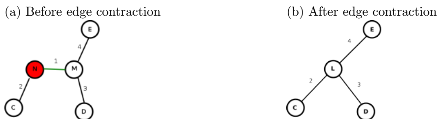
Figure 2: Demonstration of edge contraction

The Maven project for this lab is located in the following svn repository: