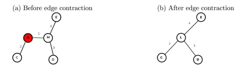
Figure 2: Demonstration of edge contraction