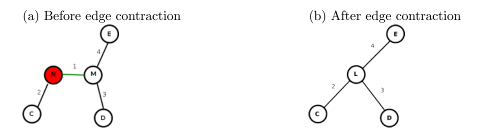
Figure 2: Demonstration of edge contraction